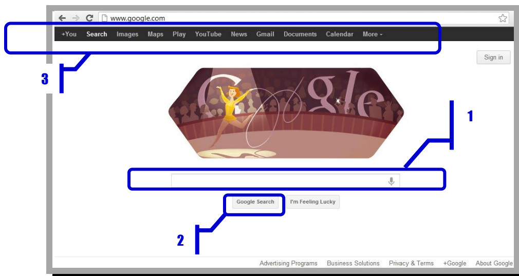
Figure 1. The Google User Interface

Google’s “free” and easy-to-use Internet search service begins with a very familiar user interface (or home page). Using a web browser such as Google Chrome®, Mozilla Firefox®, Internet Explorer®, or Safari®, the web address, www.Google.com , is entered as shown in Figure 1. By entering a keyword (or phrase) in the search box (section 1) and clicking the “Google Search” button (section 2), a basic user-initiated search can be requested. In addition to using the Google home page to search relevant results on the World Wide Web, users are also able to perform specific searches (i.e., You, Search, Images, Maps, Play, YouTube, News, Gmail, Documents, Calendar, and More) by clicking the links located at the top of the Google page (section 3).