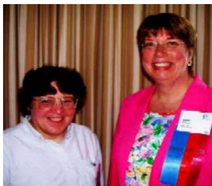
Greetings from our PharmaSUG 2005 conference co-chairs