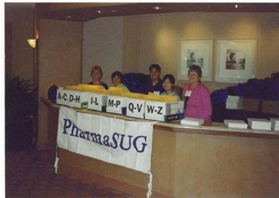
Happy PharmaSUG Volunteers Be One!

We look forward to seeing you in Phoenix in May!