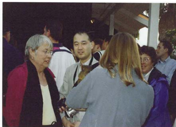
A PharmaSUG sponsored outing at the San Diego Zoo (above) and happy conference goers (below)

Many, many thanks to everyone who took part in making PharmaSUG 2004 a huge success!