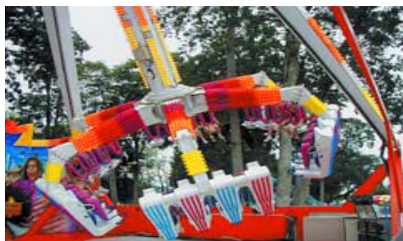
Plan to enjoy a great conference and great experience in Portland!

Most importantly, join the Portland Rose Festival! You will be there in the heat of the festival. Check out this website http://www.rosefestival.org/ for events calendar. Tall ships, fireworks, parades, tours - to name a few of the endless festivities. It is going to be a blast.