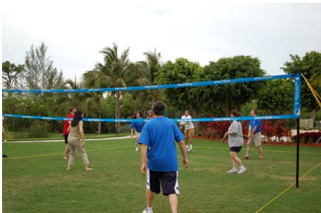
Fun at PharmaSUG 2006