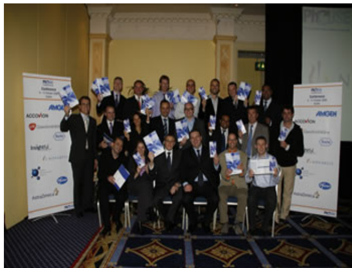
Greetings from our European colleagues at PHUSE 2006