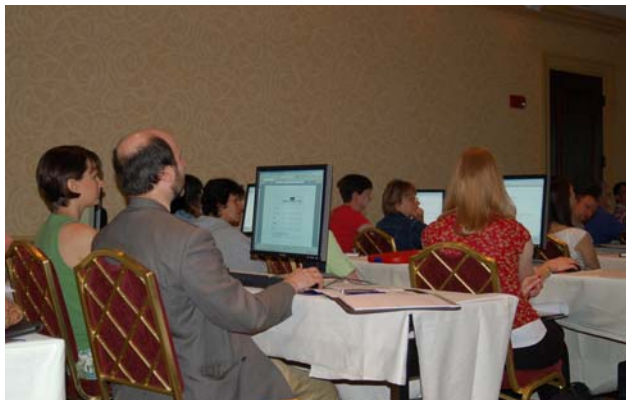
Take advantage of Hands-On Workshops at PharmaSUG 2007