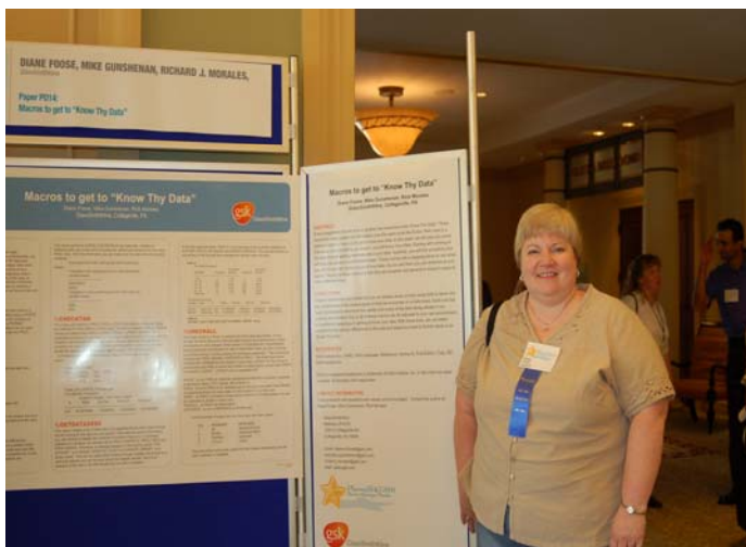
Poster presenter at PharmaSUG 2006 in Florida

Plan to attend PharmaSUG 2007 in Denver, June 3-6, and come early and/or stay late and enjoy what the region has to offer. Please check the website, www.pharmasug.org , often for updates on things to do in Denver while you're at the conference.